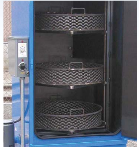
3 turn tables with baskets