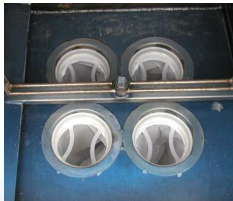
4 Filters in place