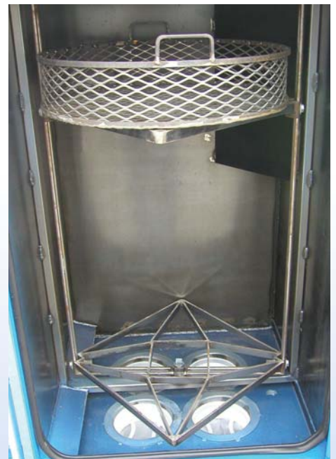
Limitless loading combinations